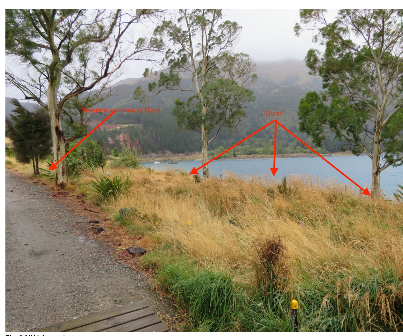
Fig 4 NW Aspect

We look forward to a positive response to this proposal.