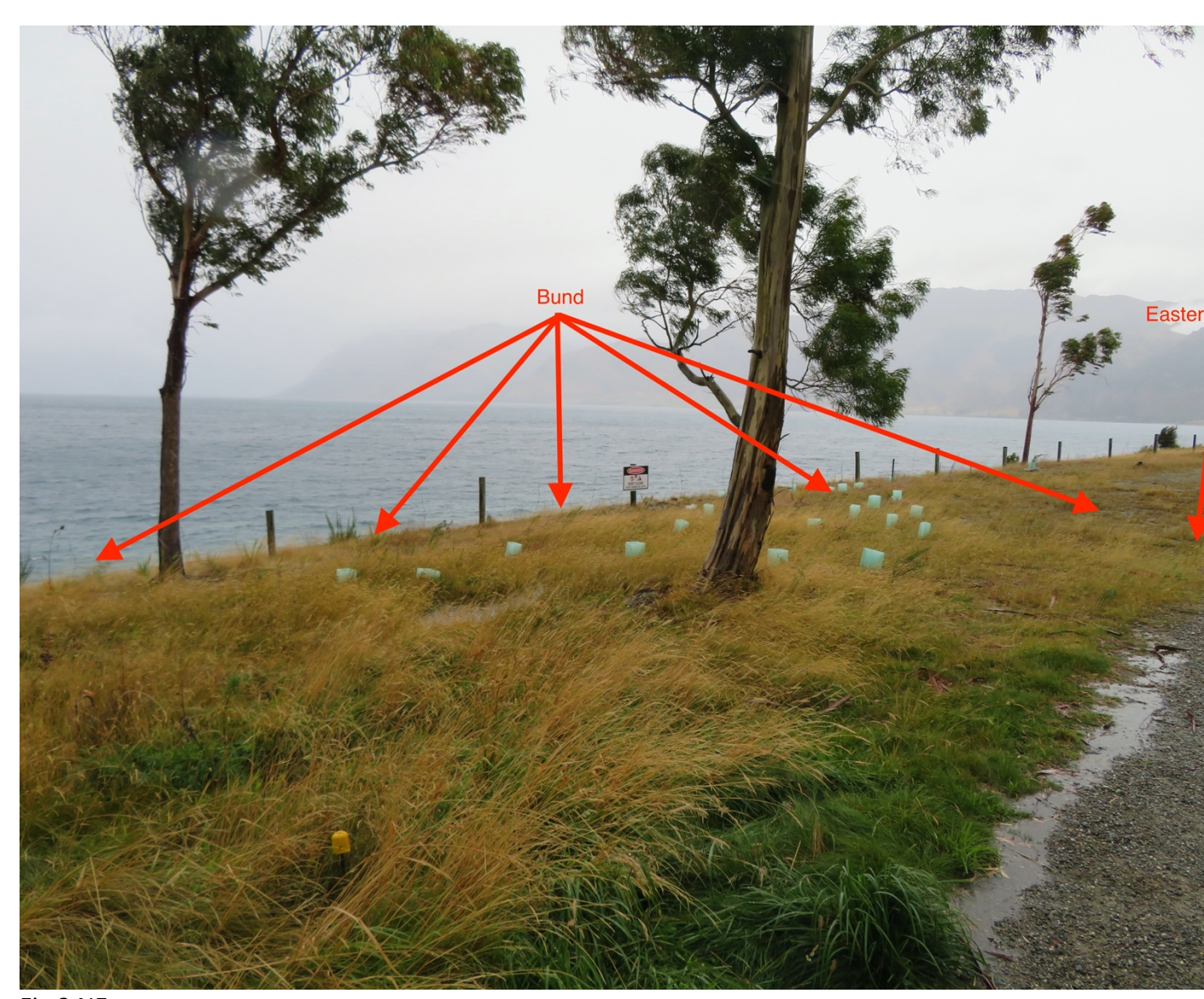
Fig 2 NE aspect