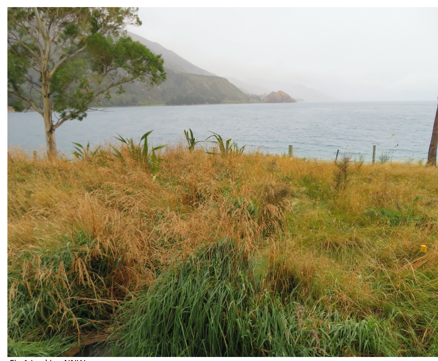
Fig 1 Looking NNW

The area will increasingly become a pleasant natural area of native plants and thus assist wider efforts to enhance biodiversity. We consider this aspect is worth protecting and enhancing. In that regard we see the proposed engineering solution as being: 1) 'urban' like and not appropriate for the site, 2) does not address the issue of contaminants, and 3) unnecessarily expensive.